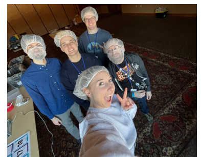
Shown: TAP serving at Quake, Alexandria's Car Care Program, Mount Carmel's Young Adult Retreat & Family Camp Recharge; along with a fun trip to Florida!